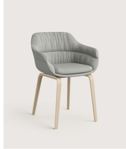
Soft fully upholstered version: featuring a relaxed cushioned look with seat cushion insert.

This version can be combined with all six frame types, with armrests as a further option. The features can now be configured one by one to create the perfect chair for use in cafeterias, restaurants, conference rooms and hospitals.