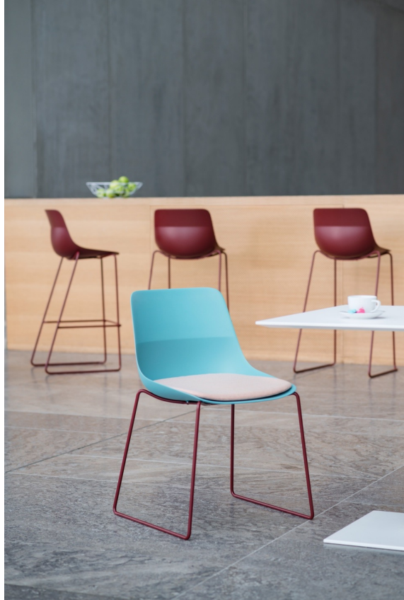
BRUNNER | CRONA LIGHT